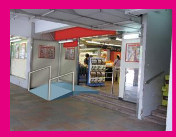
Inclusion Solution: Add a ramp and handrails

So what can the government do to rectify this situation? The EOC has already laid out both policy and operational recommendations in our FI report, but I would like to emphasize a few points here.