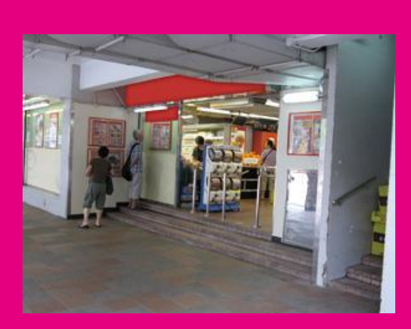
Example of Barriers: Stepped entrance

The government should do more – indeed, they should lead this fight to ensure accessibility for all. In June, the EOC announced our findings of the Formal Investigation (FI) on Accessibility to Publicly Accessible Premises. After inspecting sixty government-owned buildings, we found that government-owned premises are doing a far from satisfactory job in providing barrier-free facilities. And at the last LegCo By-Elections, despite the fact that the EOC had raised this issue ten years ago, a full 15 percent of polling stations remained inaccessible to PWDs.