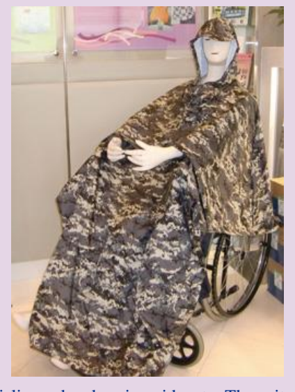
The CAC has also designed a wheelchair raincoat, antislip socks, dressing aids, etc. These items not only facilitate easy dressing, but provide protection as well.