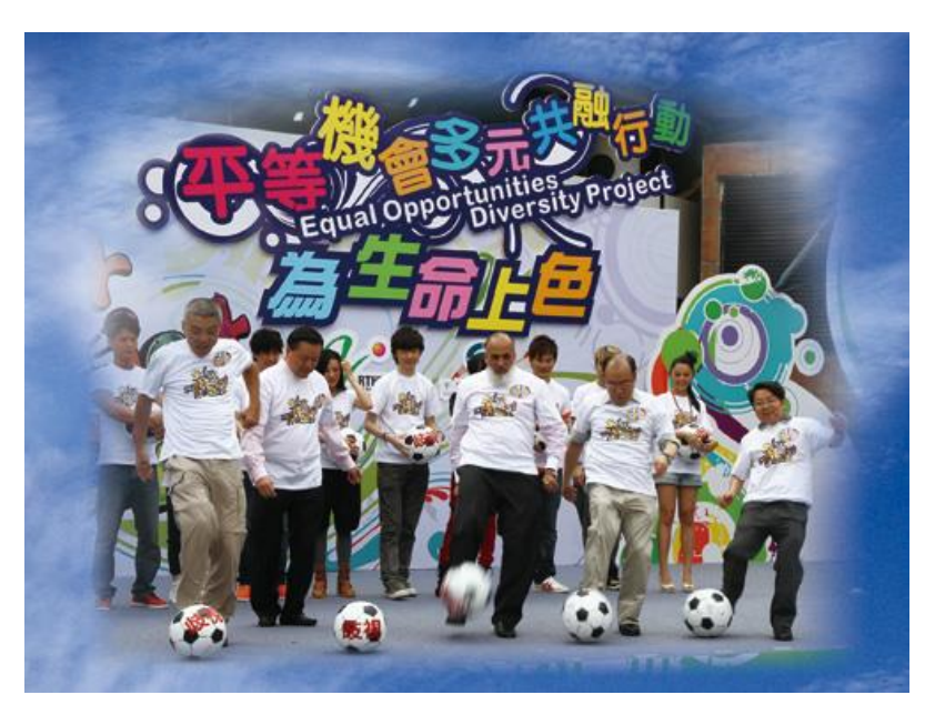
EOC Members officiated at the programme by kicking away footballs imprinted with the word "Discrimination" to symbolize the society-wide effort to eliminate discrimination.