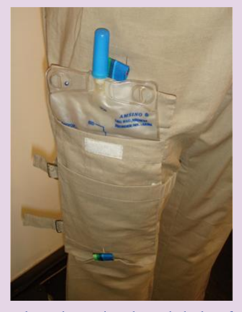
In the past, PWDs would tie their urine bag to their lower leg and cover it underneath the leg of their trousers in order to avoid embarrassment. But removing it could be a problem. These CAC-designed trousers make it easy for the wearer to conceal the urine bag at the thigh or lower leg position. No additional accessories are needed. And the urine bag is hardly noticeable.